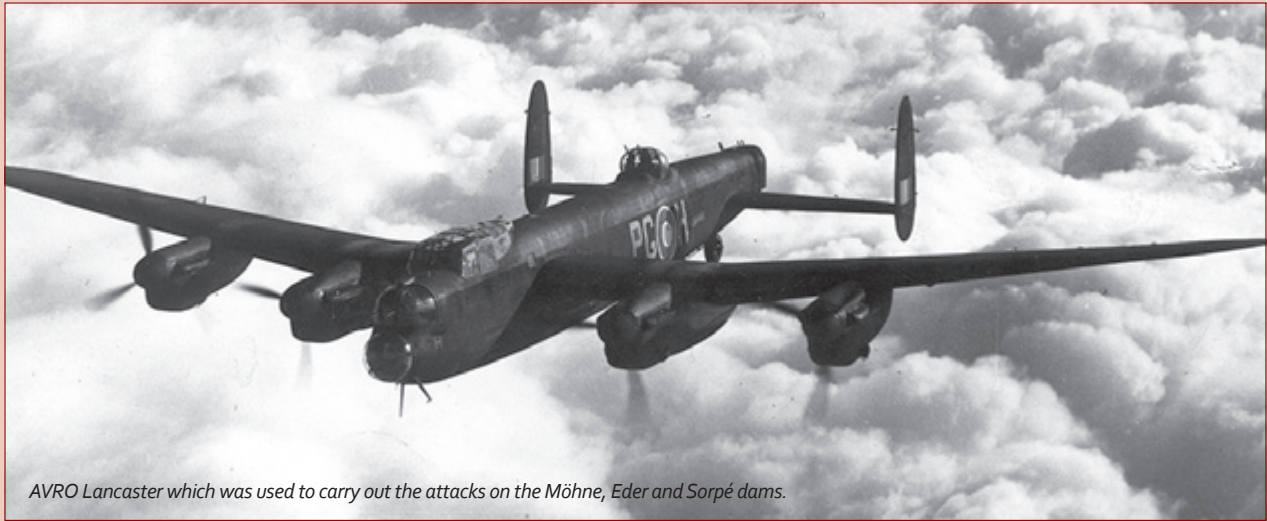
AVRO Lancaster which was used to carry out the attacks on the Möhne, Eder and Sorpé dams.

You may also visit the site on which Guy Gibson and James Warwick crashed in their De Havilland Mosquito. You will find this location just outside the city centre within 15 minutes walking distance from the starting point. The street